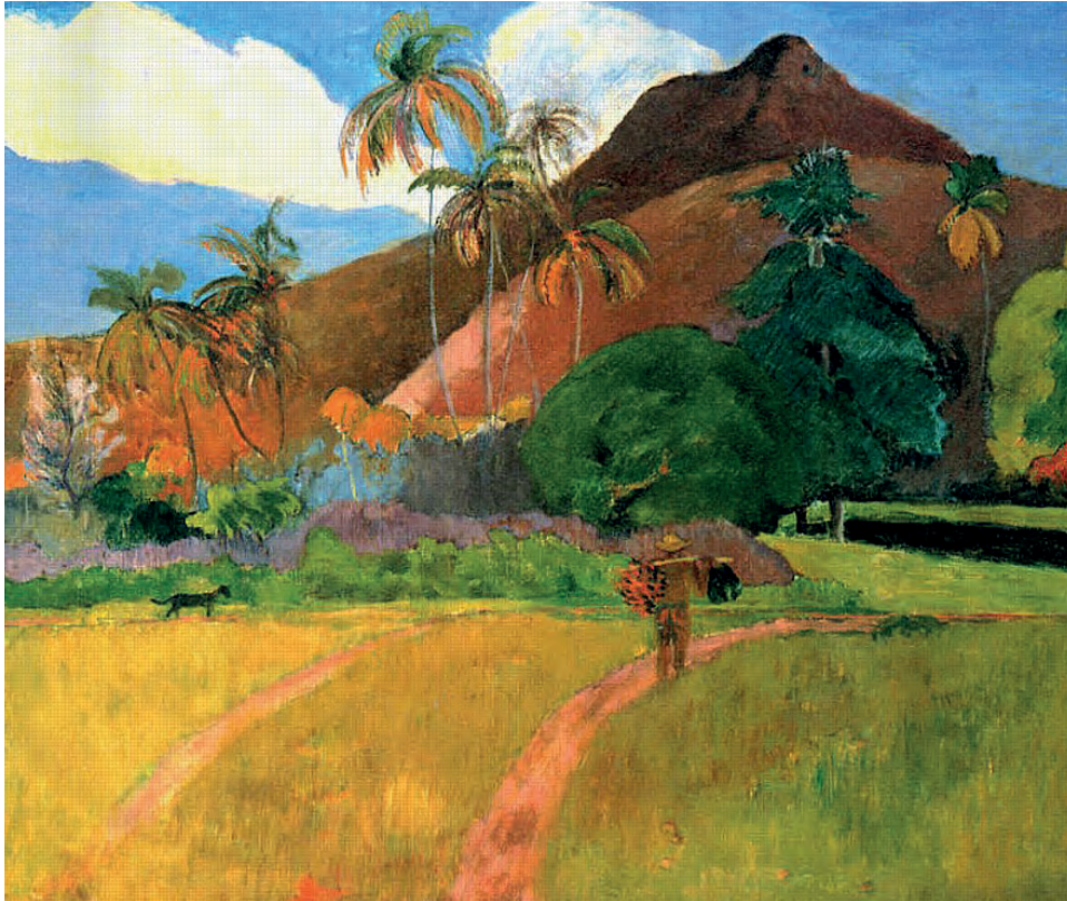
Paul Gauguin Tahitian mountains , 1893