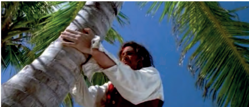
Video still of Rodney Grahams film Vexation Island , 1997

Across continents, religions and cultures, the palm tree carries a promise of prosperity, peace and salvation. It conjures up images of luxury, jet set and eternal sunshine and represents a kind of modern paradise. The Palm was in the 19th century an utopian projection image for the departure into a new world, and for the painter Paul Gauguin the palm created a fascination for the exotic and the foreign, in Rodney Grahams film "Vexation Island" you find a roar of surf and wind, a feeling of paradise-style euphoria.