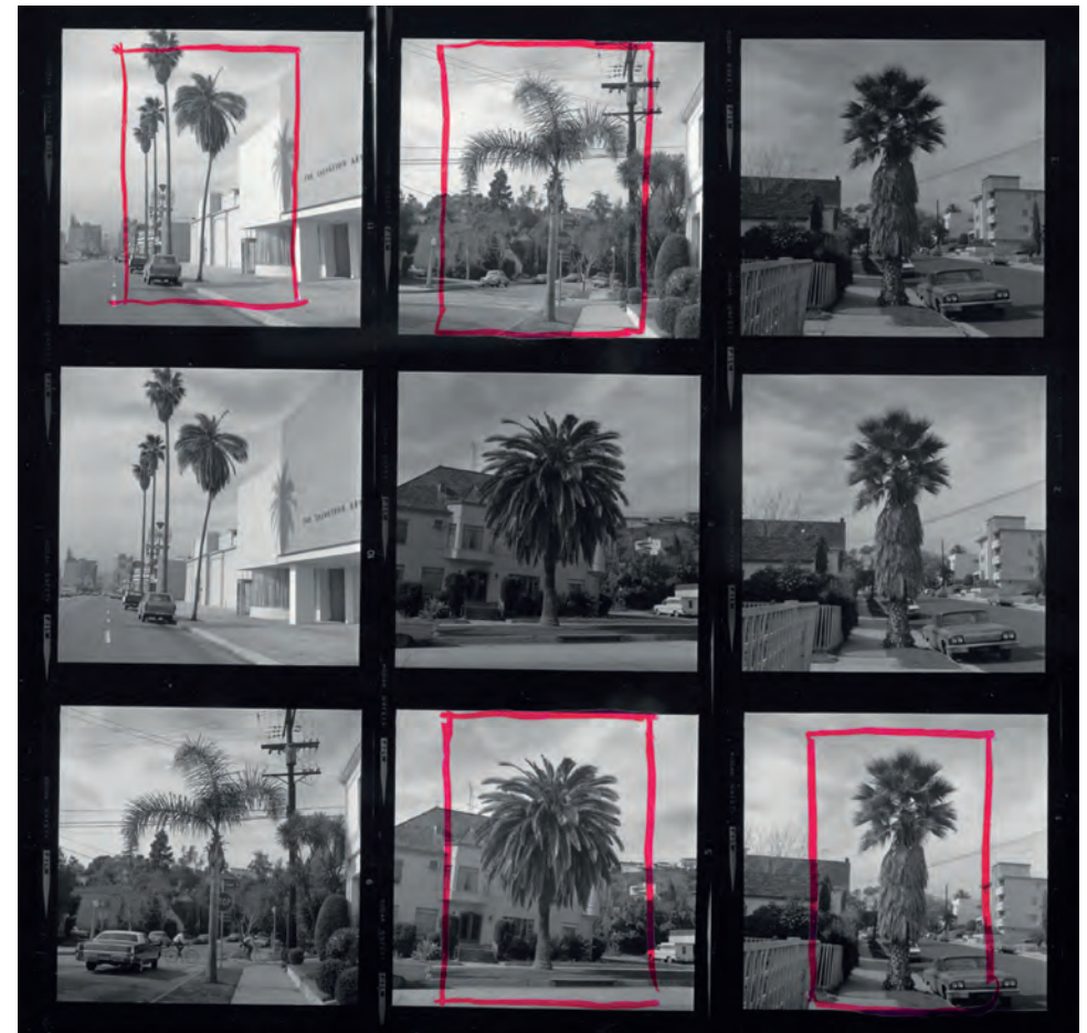
Edward Ruscha from the publication A FEW PALM TREES , 1971

Across continents, religions and cultures, the palm tree carries a promise of prosperity, peace and salvation. It conjures up images of luxury, jet set and eternal sunshine and represents a kind of modern paradise. The Palm was in the 19th century an utopian projection image for the departure into a new world, and for the painter Paul Gauguin the palm created a fascination for the exotic and the foreign, in Rodney Grahams film "Vexation Island" you find a roar of surf and wind, a feeling of paradise-style euphoria.