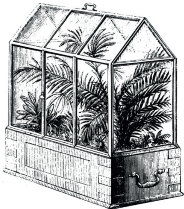
Wardian Case by Nathaniel Bagshaw Ward, 1829