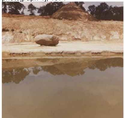
Spiral Hill - Broken Circle [colour photograph 2], 1971