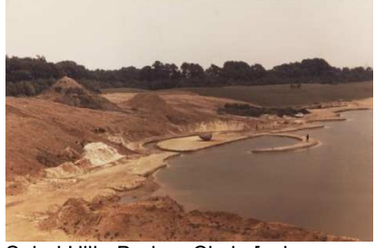
Spiral Hill - Broken Circle [colour photograph 1], 1971

"As soon as an artist gets over the notion that art is merely a matter of shipping objects around, or putting paintings on walls, he will discover whole new areas of investigation, that involve questions of sit, nature, politics, and value. As long as artists are outside the dialectics of nature, art will be abstract currency." (Robert Smithson)