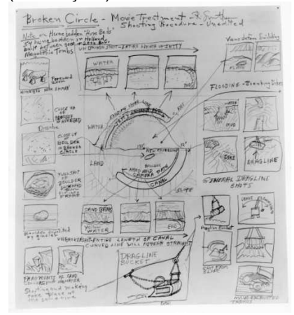
Broken Circle, Shooting Procedure, Movie Treatment, 1971