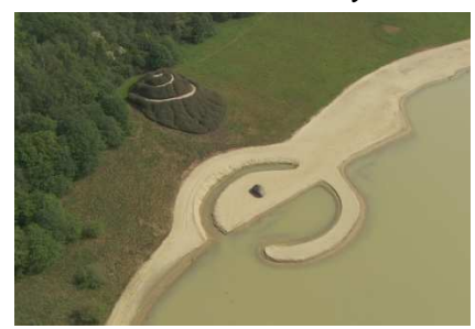
Breaking Ground: Broken Circle/Spiral Hill 1971–2011, video

4<sup>th</sup> March to 28<sup>th</sup> May 2012