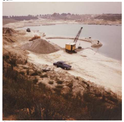
Spiral Hill - Broken Circle [colour photograph 4], 1971